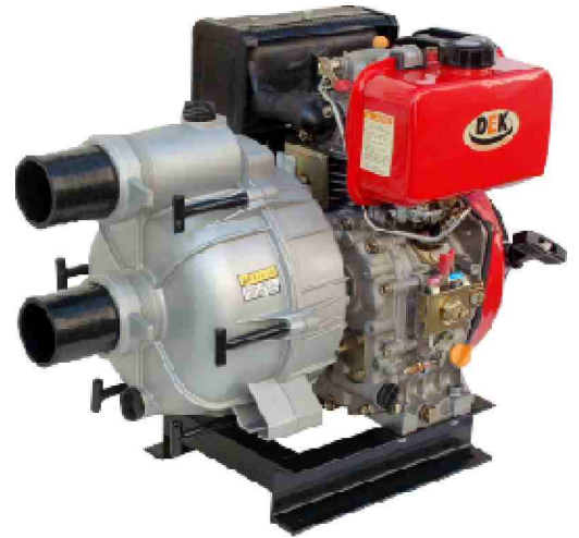
TP80 c/w DEK Diesel Engine F300 & Frame