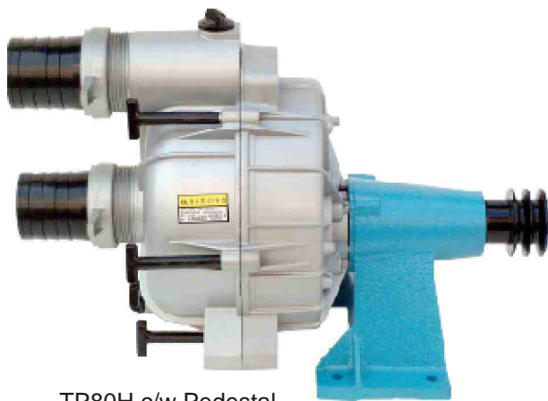
TP80H c/w Pedestal